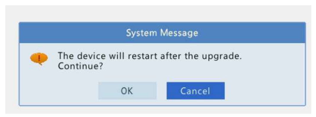
Figure 1 Prompt Message