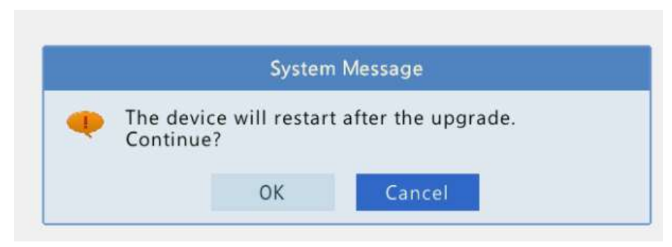
Figure 1 Prompt Message

(6) The NVR will restart automatically when the upgrade is completed.