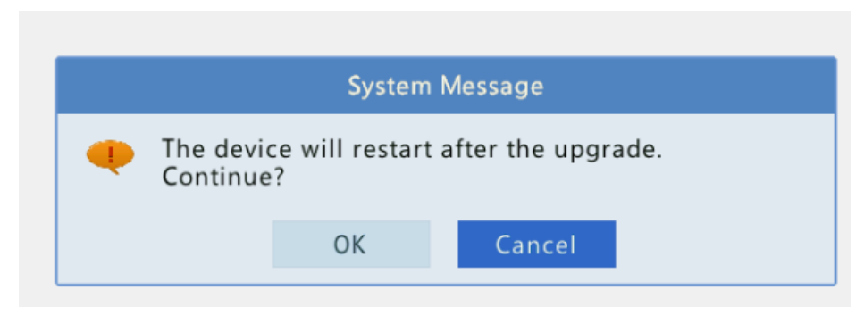
Figure 1 Prompt Message

(6) The NVR will restart automatically when the upgrade is completed.