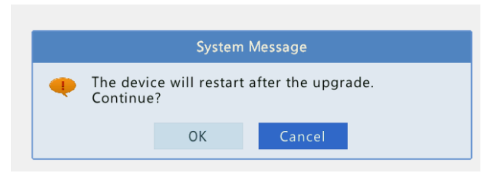
Figure 1 Prompt Message

(6) The NVR will restart automatically when the upgrade is completed.